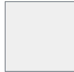
Frost White (TWK)**